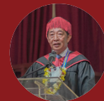
Hon. Dennis Norman T. Go

“Perhaps the most valuable result of all education is the ability to make yourself do the things you have to do when it ought to be done whether you like it or not. Being prepared to do that, being prepared to do your role, being prepared to be remarkable, being prepared to be fabulous – that’s the essence of transformative education”